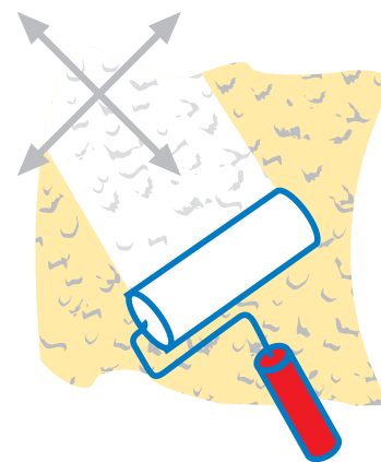
Apply paint in criss-cross strokes.

Spraying Sandtex® Masonry Paint is not recommended as spray painting outside could prove difficult to control and would not ensure an even coverage.